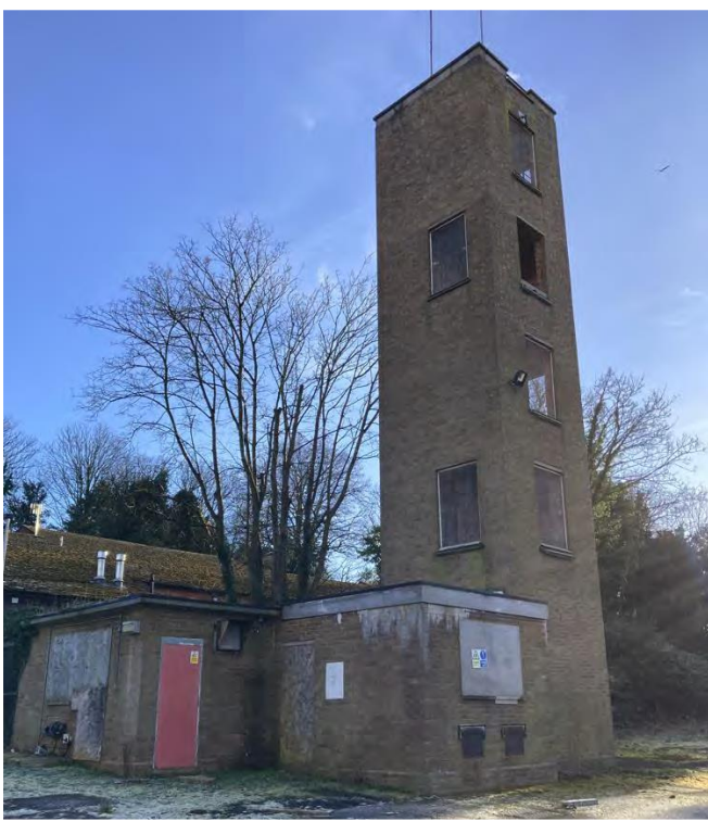
View of training tower