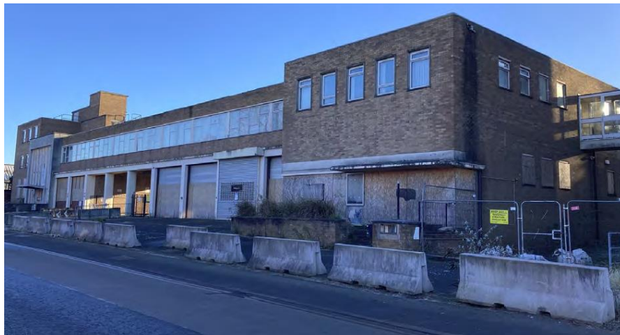
View from Windsor Street of Office Block and Fire Station