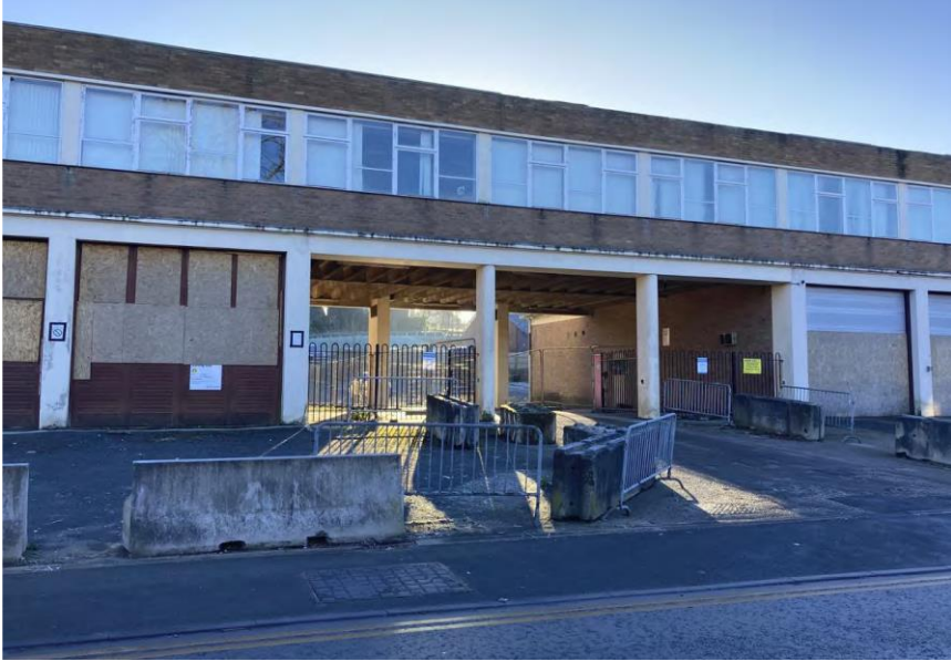
View of under-croft providing access through site from Windsor Street