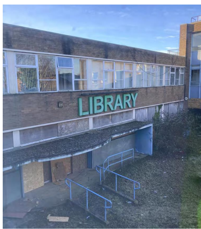
View of Library from the north