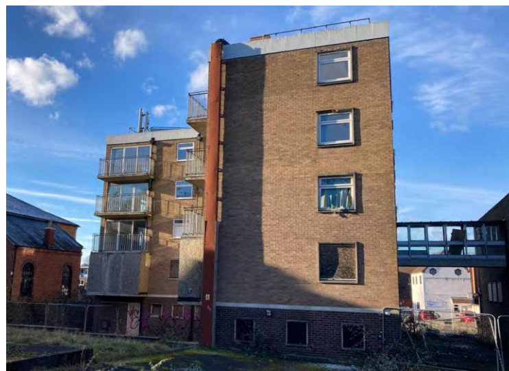
View of Amplett Court from courtyard hardstanding area