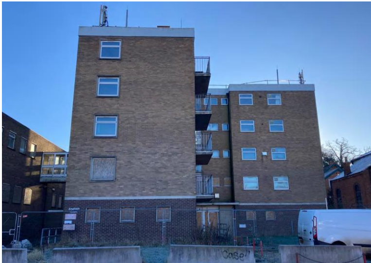
View of Amplett Court from Windsor Street