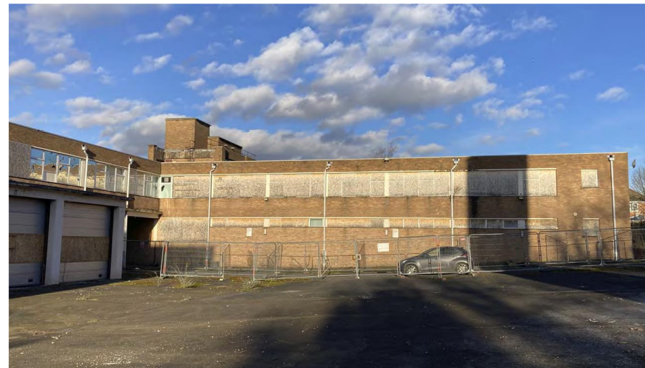
View of rear of Fire Station from courtyard hardstanding area