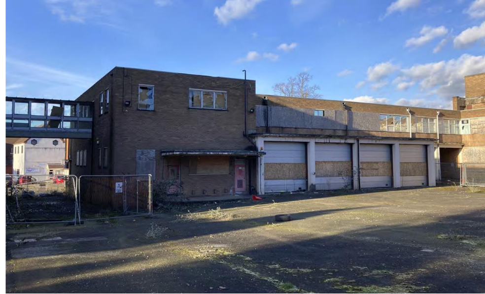
View of Office Block / Library from courtyard hardstanding area